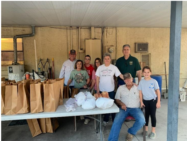
Pre-Christmas Food Distribution-December 2021

During the past program year the Arcadia Elks Lodge has contributed $7000 in direct charitable works here in DeSoto County. We have been able to do this service in our community because of grants to the lodge from the Elks National Foundation. Your dues help support the Elks National Foundation, but additional contributions to the Foundation allow for grants to be provided to lodges. A small lodge such as Arcadia Lodge 1524 can do this level of service only because we receive these grants. Please consider making contributions to the Foundation.