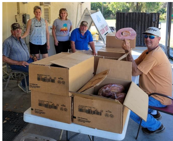
Pre-Easter Food Distribution-March 2022